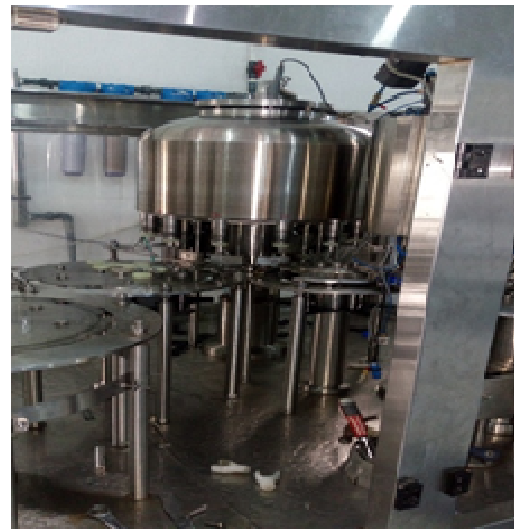
Fig. 1. Filling machine

of 100 bottles of different sizes of bottled water. The time spent to fill and cap each bottled water of different sizes on each of the machines is noted putting into consideration 100 bottles of water ranging from 25 cl, 50 cl, 60 cl, 75 cl, and 150 cl sizes respectively.