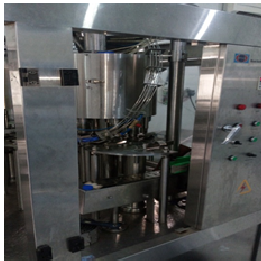
Fig. 2. Capping machine